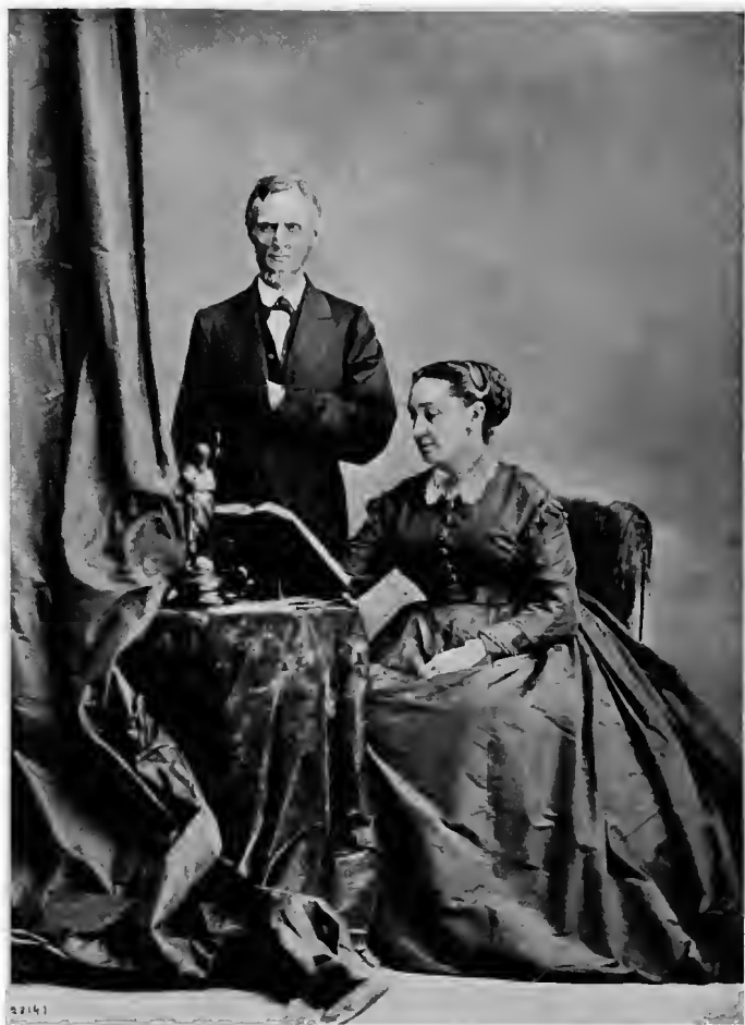
JEFFERSON DAVIS, PRESIDENT C. S. A., AND MRS. DAVIS